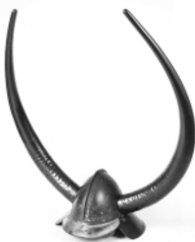
Helmet in the shape of a peach with attached bison horns. Early seventeenth century.