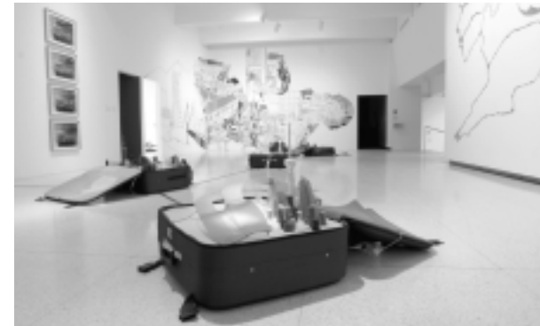
Installation view with Yin Xiuzhen's Suitcase Series (centre).