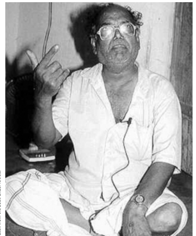
Taken from the book under review.