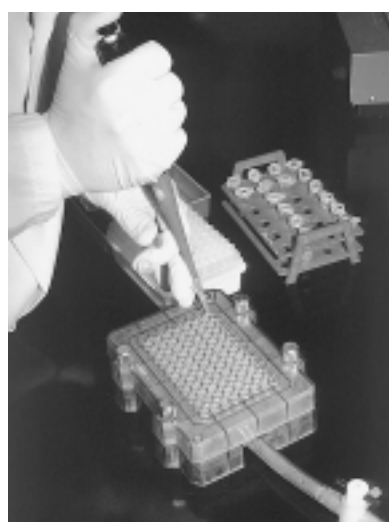
Molecular biological experiments in the laboratory

This was exactly the point made by the Xinhua News Agency. In an editorial on 6 June 2001, the following was written: