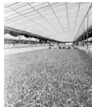
Biotechnology experiments in greenhouses

Xinhua News Agency pointed out that only China has not