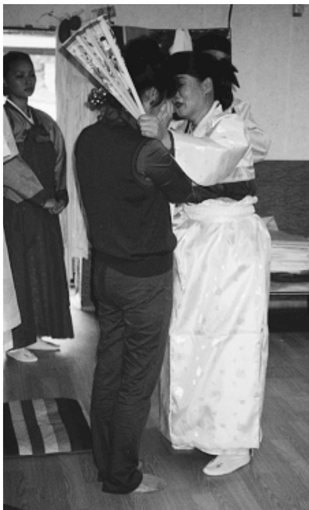
An emotional encounter between the client and her deceased mother, who has entered the body of the shaman.

In the context of globalization in the twenty-first century it may seem incongruous to speak of shamanism as a significant phenomenon in such a highly developed, industrial nation as (South) Korea. If one tends to associate shamanism with 'primitive culture', it will be a surprise to discover that in and around the metropolis of Seoul the rituals of the shamans ( mudang ) are very much in demand, because many people consider them an effective way to cope with the material and spiritual needs of modern society. Consequently shamans – who incidentally in most cases are women, as are their clients – still play an active role in Korea. Mediating between the world of gods and ancestors and that of humans, they perform rituals that are intended to resolve all kinds of problems and bring people happiness, health, and affluence in their present life.