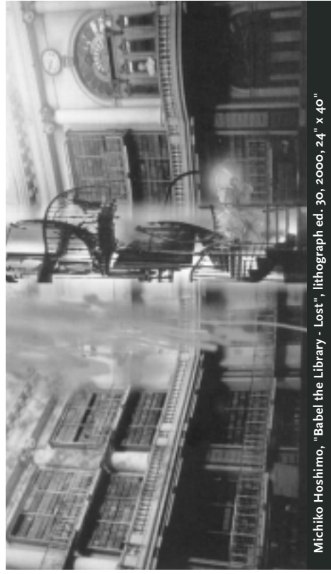
Michiko Hoshimo, "Babel the Library - Lost", lithograph ed. 30, 2000, 24" x 40"

95 Donghuamen Dajie Dongcheng District Beijing, 100006 Tel.: +86-10-6526-8882 Fax: +86-10-6526-8880