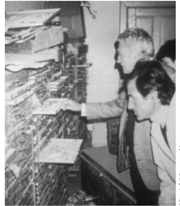
Empty trays of the Coin Cabinet, Kabul Museum.

The faïence head of a Graeco-Bactrian king was found in June 1998 in unrecorded circumstances. It once belonged to an acrolithic statue: the horizontally cut edge below the head was meant to fit into a wooden structure representing the rest of the body. So far, the fragments of a cult statue found in the cella of the main temple at Ai Khanum and this faïence