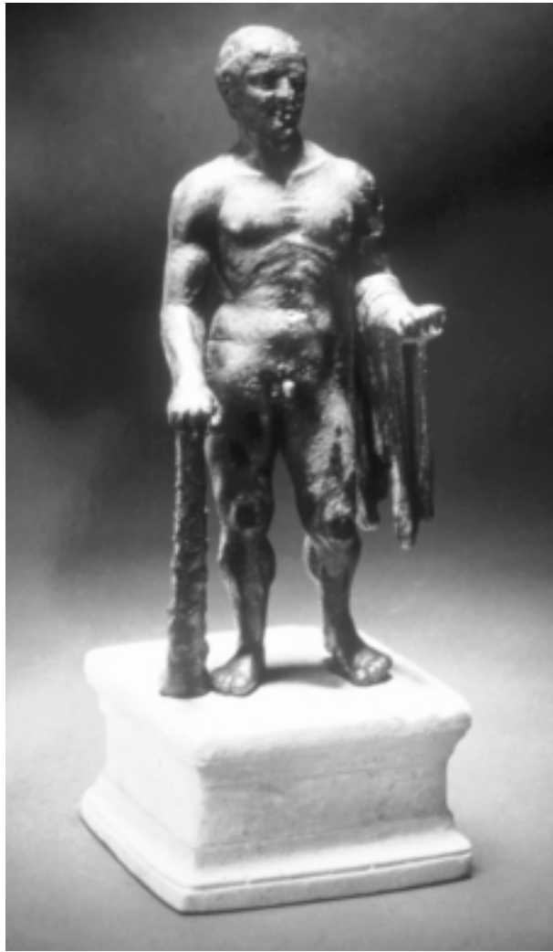
Bronze statuette of Heracles from Ai Khanum.